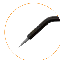
Needle electrode tip