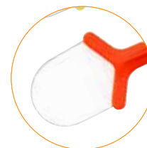
Loop electrode tip