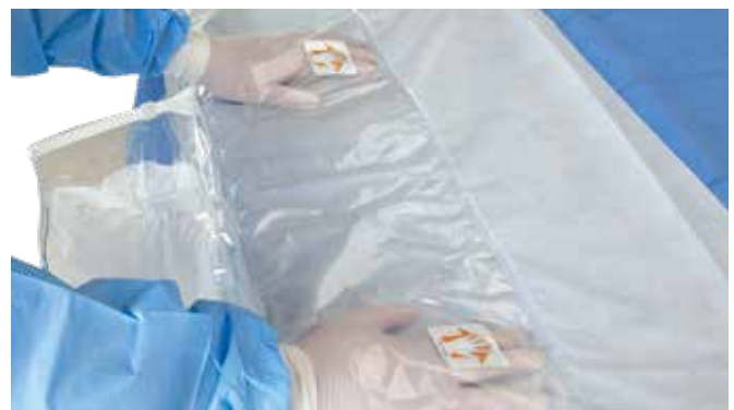
Cuff pockets provide easy aseptic positioning

Fairmont Medical's Under Buttock Drape will assist surgeons in capturing all patient body fluid run off from the surgical site, such reducing body fluid containment, post operative clean-ups and allowing examination of tissue deposits captured in it's pouch filter mesh. The drape is made from a tough non-woven material and will with stand heavy manipulation during use.